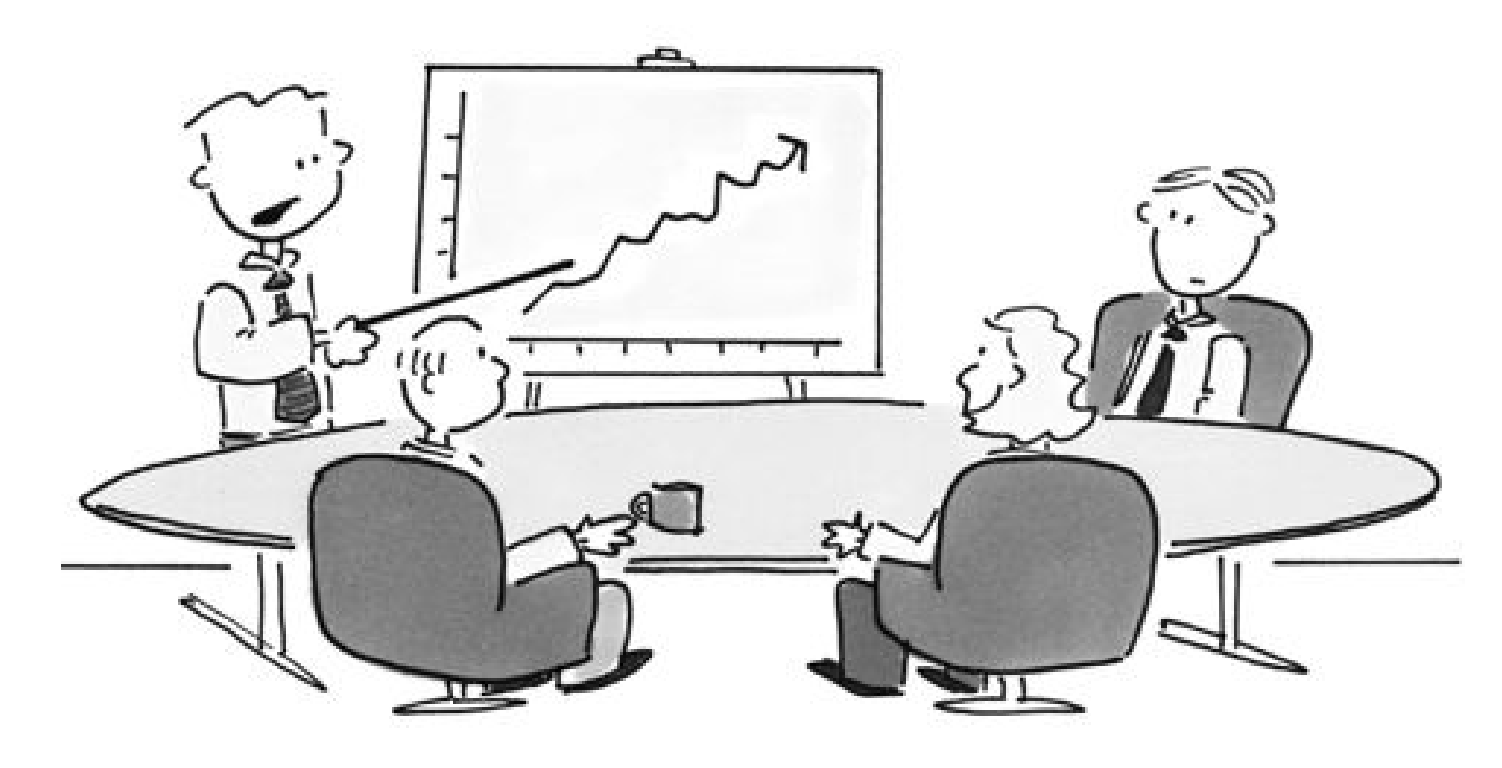
"Thank you for coming, efficiency is up fourteen percent, meeting adjourned."